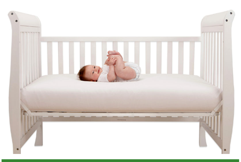
Crib mattresses without toxic flame retardants are good for baby and business.

Through research and exploration, the company found it could meet its goals using food grade polyethylene (PE) because of its lower flammability properties. Polyethylene foam, through design engineering, allows Lullaby Earth mattresses to pass flammability tests without the use of flame retardant chemicals.