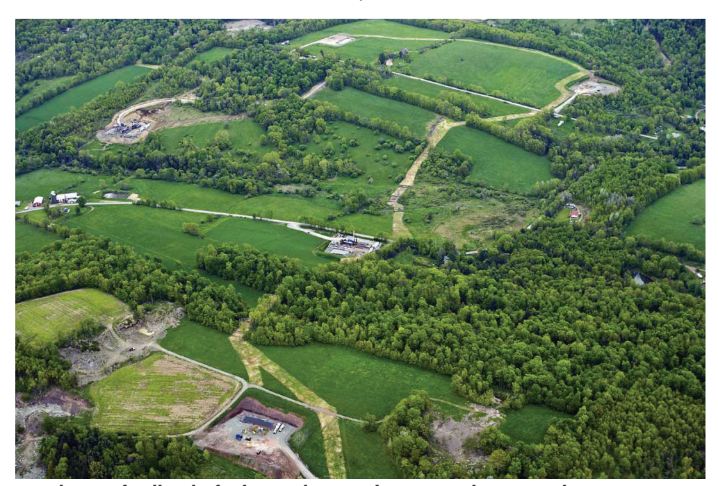
Aerial view of well pads, feeder pipelines, and access roads in Dimock, PA

State and federal financial assurance requirements must be significantly improved to protect the public, environment and local economies over the long term by making stronger bonding rules, eliminating exemptions and integrating the financial assurance rules into a comprehensive regulatory framework. 53