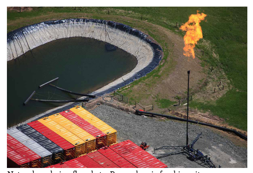
Natural gas being flared at a Pennsylvania fracking site

loans for, residential properties leased for heavy industrial and commercial activity. <sup>41</sup> Many owners who did not get prior consent from their lender before signing a lease are now in "technical default" under the terms of their mortgages. <sup>42</sup> Insurance companies also recognize the sizable risk of damages posed by shale development. In an internal memo, Nationwide Mutual Insurance Co. explained they would not provide policies because "the exposures presented by hydraulic fracturing are too great to ignore." <sup>43</sup>