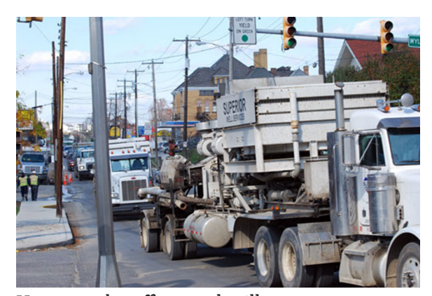
Heavy truck traffic crowds village streets.

It takes approximately 1,200 truck trips to bring one gas well into production, 350 truck trips per year to maintain, and 1,000 truck trips every 5 years to