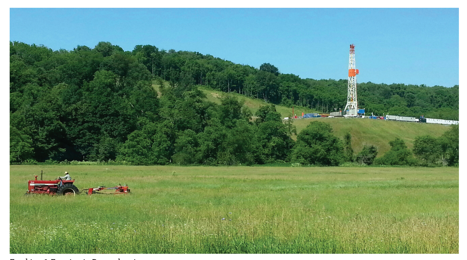
Fracking & Farming in Pennsylvania

The American Sustainable Business Council calls upon the Environmental Protection Agency and other federal agencies to set minimum standards and provide clarifying rules on the conditions and locations under which hydraulic fracturing can be conducted. ASBC also holds that fracking accelerates dangerous climate change and is not a sustainable option.