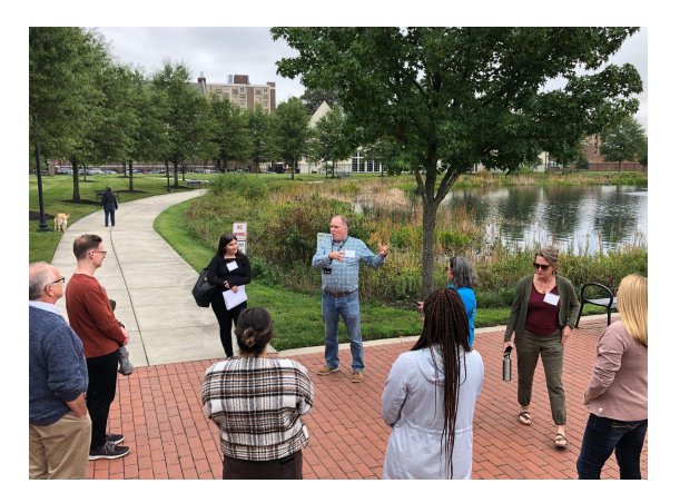
The Wilmington Public Works department leads a tour of the Cool Spring Park Eco-trail, which provides a thriving community space as well as stormwater management.

The Sustainable Business Network of Greater Philadelphia led participants on a field trip to two green stormwater infrastructure (GSI) sites; both sites were partnerships between the Wilmington Department of Public Works and